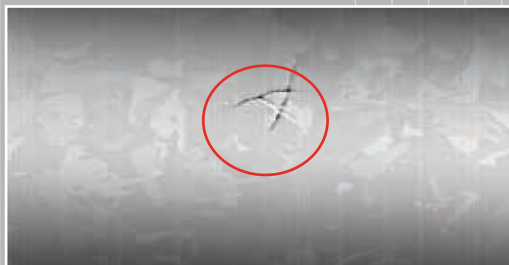
• Semiconductor inspection