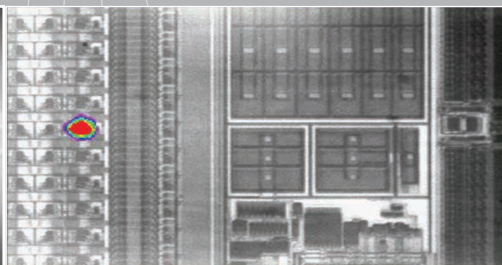
• Semiconductor inspection