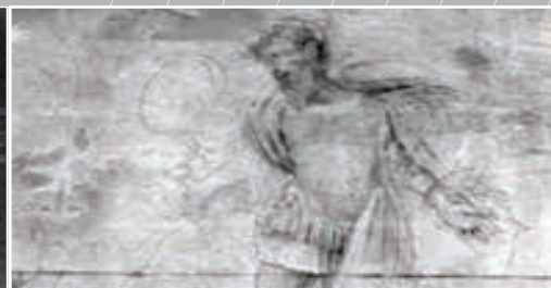
• Art inspection