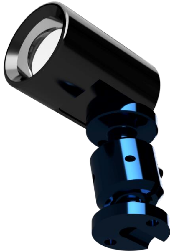
Optional Swivelink Mount