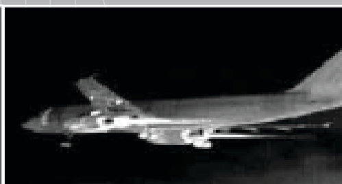
• Vision enhancement