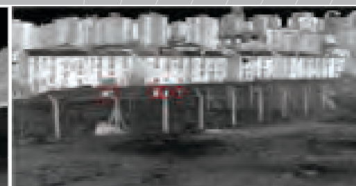
• Border security