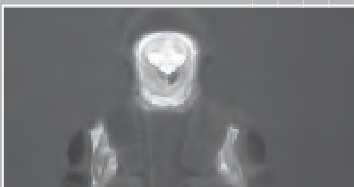
• Thermal security