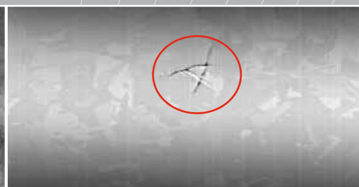
▣ Crack inspection (solar wafer)